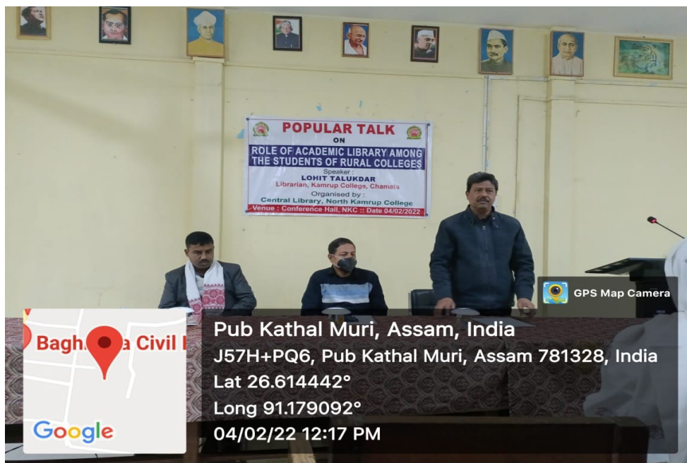
Photo of the event