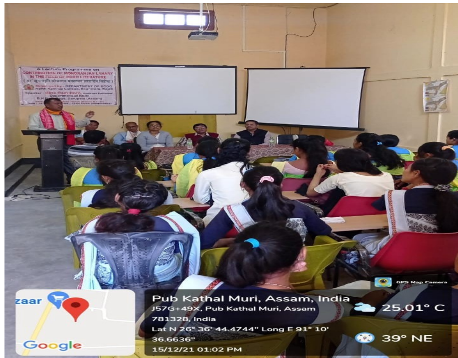
Photo of the event